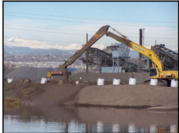
Komatsu PC 750 Excavator with long boom and stick

an owned Komatsu PC750 hydraulic excavator with an extended boom and stick configuration capable of excavating up to 60 feet. The excavator bucket was equipped with specialized rock ripper teeth to facilitate excavation of the bedrock key.