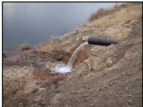
Draining operations from canal infiltration

Envirocon had to physically drain the eastern side of the site due to large amounts of water infiltration from the adjacent irrigation canal prior to installation of the workpad and slurry wall. This condition needed to be rectified to eliminate elevated groundwater conditions which created trench stability concerns.